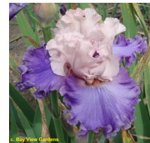
'Share The Love'