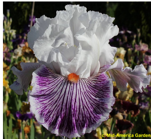
Iris Shows - Traditional and Virtual