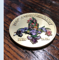
AIS Centennial Medal

Sale ends Sunday, July 19, 2020 at 8:00 PM CDT.