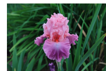
2020 Virtual Show - Velvet Valentine

With almost all of the physical iris shows being cancelled because of the pandemic, some groups have gone to virtual iris shows. While not eligible for AIS medals and ribbons, club ribbons can be awarded.