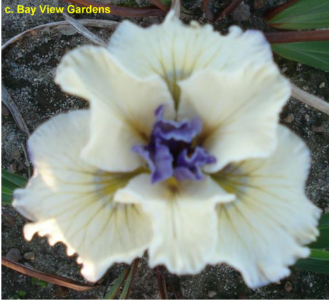
c. Bay View Gardens

Draft schedules can be sent via e-mail or USPS, but email is preferred. It speeds up the process and saves everyone a little on postage.