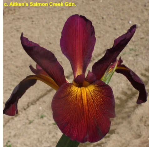
c. Aitken's Salmon Creek Gdn.

While only members can purchase seeds, you can join online with your order. Details and the list of seeds will be available here .