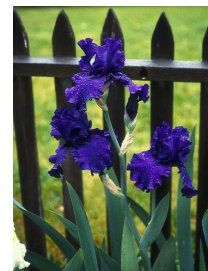
2017 Winner 'Dusky Challenger'

The 2018 Tall Bearded Iris Symposium kicked off with the publication of the ballot as an insert in the Spring 2018 Irises Bulletin . There are 478 irises for you choose up to 25 in voting. All AIS members are eligible and urged to vote. Votes need to reach your RVP by September 1st.