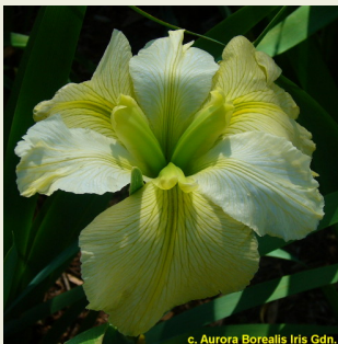
c. Aurora Borealis Iris Gdn.