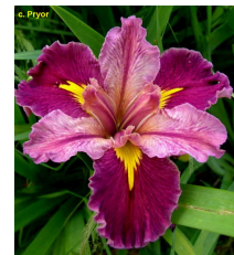
'Word Of Warning'

We're so very happy with the enthusiasm demonstrated by both AIS and SLI members as shown by their early registration for the 2018 Convention in New Orleans -- we are thrilled beyond measure, but unfortunately we have -- almost -- reached a point that we're having to stop selling garden tour tickets.