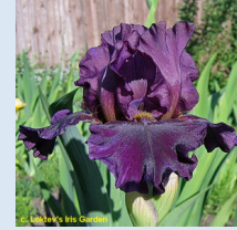
'Meet You At Midnight'

Be sure to check out the ones in your area and the others you might travel to. You are not limited to one!