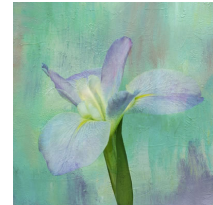
Adult Effects Winner - Susan Bailey

The 2016 AIS Photo Contest is over and the winners are now on the AIS website. This page has links to photo galleries of the winners from 2008 to the present. See the top photos in all six adult categories and the youth category. This is a direct link to the 2016 Photo Contest Winners .