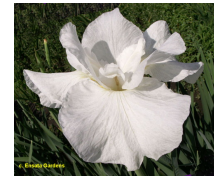
'Swans In Flight'