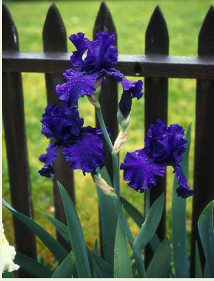
'Dusky Challenger' - 2015 Winner

The AIS Tall Bearded Iris Society Symposium is the opportunity for all members to vote for their favorite TBs. And now is the time for you to vote; send your choices to your RVP to arrive by September 1st!