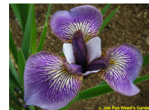
'East Meets West'

One of those things that sneaks up on me. Next weekend is the first of the Fall Regional Meetings , led off by the Region 21 and Region 9 meetings.