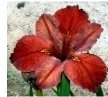
'Seminole Sunrise' - 2015 Debaillon Medal

The 2018 AIS/SLI Conventions in New Orleans will not be accepting any bearded guest irises. The people in New Orleans and Louisiana are not familiar with growing bearded irises. The decision was made we would not accept them so as not to take the responsibility of planting and growing them and having them die. Thank you for understanding.