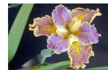
2015 Close-up Winner J. Hinrichs

The 2016 AIS Photo Contest is in its final month. There is still time for you to enter. Entries will be received until July 31st midnight - California time.