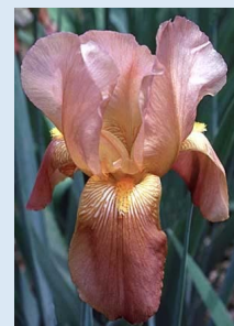
'Copper Lustre' - Dykes 1938

The latest issue of ROOTS from Historic Iris Preservation Society recently was received. Another super issue with lots of great photos of historic irises, including watercolors - see the article about Bliss irises. Among the photos were historic irises from this year's Portland Convention.