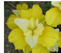
'Tree Of Songs' - 2014 Morgan-Wood Medal Winner