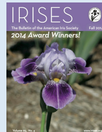
Photo Contest Winners

You can see it online with your Emembership by going here (username and password required). And learn more about becoming an Emember at the end of this newsletter.